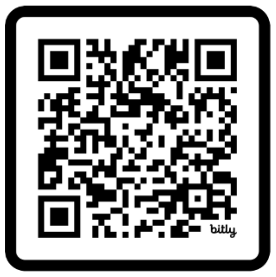
Nominate an S/C representative